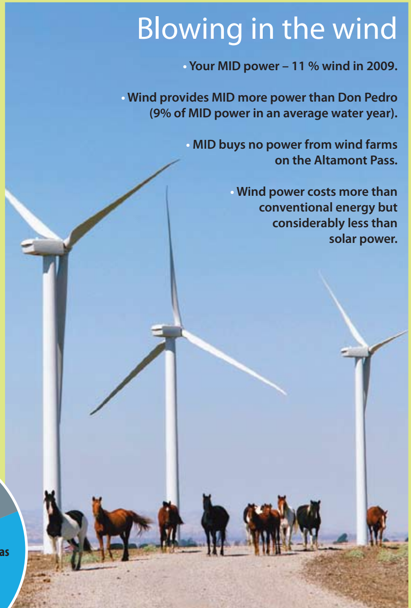
High-efficiency wind turbines in Solano County